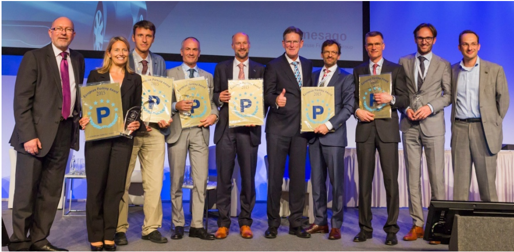
All winners of an EPA Awards in 5 categories 2015

The EPA Award is a prestigious award established by the European Parking Association for excellence in parking. The awards are granted in five categories every two years at the EPA congress. The deadline for entries is January 12, 2017. Please observe the rules and regulations which are available for download on the EPA website or by request from the EPA Secretariat .