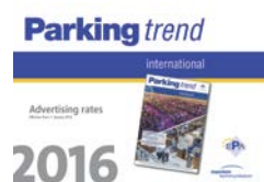
Date schedule 2016