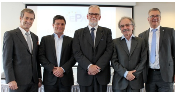
EPA Board at general meeting 2015