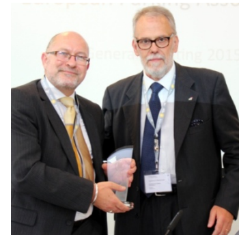
Former and new EPA president