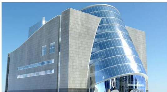
Convention Centre in Dublin

11-13 September 2013, Convention Centre Dublin