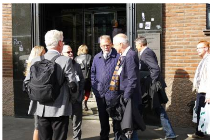
Delegates EPA general meeting in Helsinki 2012

The EPA general meeting 2013 will take place on Friday, September 13, 2013 from 14.00 to 16.00 in Dublin on the final day of the EPA congress in the Convention Centre in Liffey Hall 2.