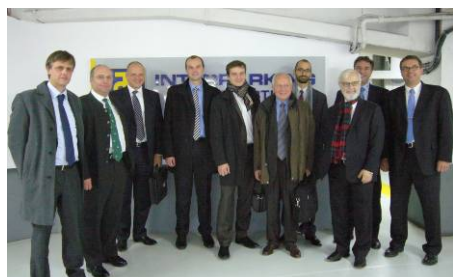
Representatives of operators and suppliers met on October 22 nd , 2012 in Brussels to discuss further proceedings in the field of E-payments

Following the cooperation with the IFSF the next steps agreed are to re-establish the task group with international suppliers and operators.