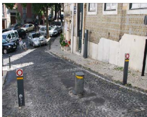
Impression from Lisbon Winner EPA Award 2011 Cat.: onstreet

Rules and regulations are available on the EPA website or from the Secretariat.