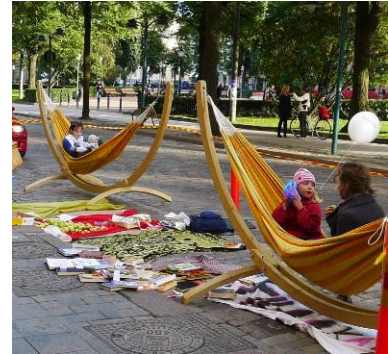
Hammocks on the kerbside: Parking Day 2012 in Helsinki

More news about the general meeting in Helsinki, the EPA data collection, the EPA congress and the EPA Award competition are all compiled for you on the following pages.