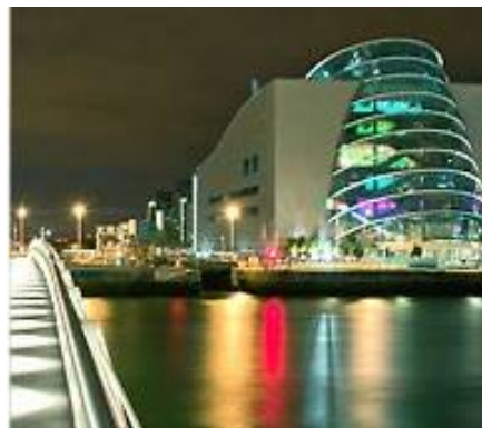
Dublin Convention Center at night