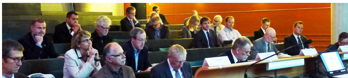
Delegates at the EPA general meeting September 21, 2012

The delegates of the general meeting unanimously agreed to all proposed amendments of the EPA statutes. The major changes lead to an enlargement of the EPA Board to up to eight members, including a representative of the associate members. This will take effect as from the next general meeting in September 2013. Until then members will be asked to nominate guests to the Board.