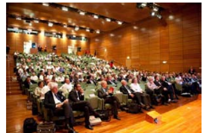
323 delegates from 27 countries attended the scientific programme