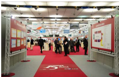
Exhibition with 40 companies from 11 countries