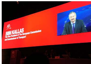
Video message by EU transport Commissioner Siim Kallas